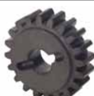
Pinion Z20 for rack