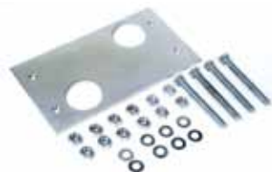
Foundation plate with side and height adjustments