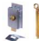
Various accessories page 194