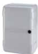
Enclosure mod. LM for control boards