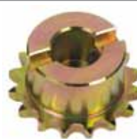
Pinion Z16 for chain