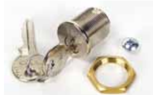
Release lock with customised key from no. 1 to no. 36

Item code from 712751 to 712786 Price (euro)