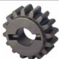
Pinion Z16 for rack