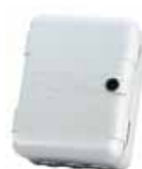
Enclosure mod. L for control boards