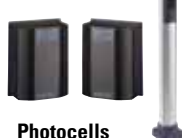
Photocells and Columns page 189