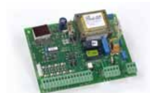
Control board 578 D (remote installation) Technical specifications page 153