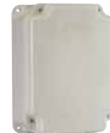
Enclosure mod. E for control boards