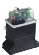
Control board 780 D Technical specifications page 153