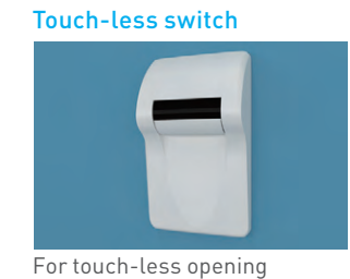
For hands-free opening