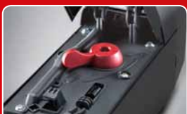
secure and convenient emergency release system