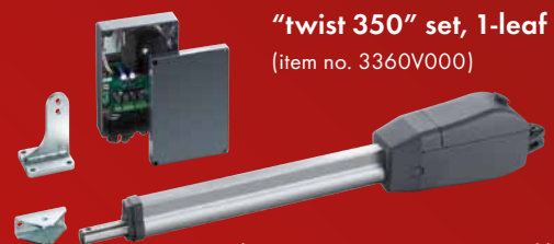
"twist 350" set, 1-leaf (item no. 3360V000)

incl. 1 swing gate operator, control board in housing, pluggable radio receiver (FM 868.8 MHz), post and gate wing bracket, 4-command transmitter (item no. 4020)