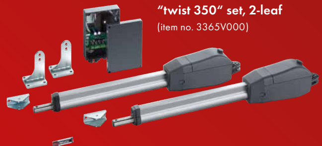
"twist 350" set, 2-leaf (item no. 3365V000)

incl. 1 swing gate operator, control board in housing, pluggable radio receiver (FM 868.8 MHz), post and gate wing bracket, 4-command transmitter (item no. 4020)