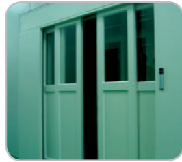
Telescopic Automatic Door