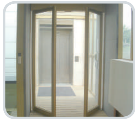
Swing Automatic Door