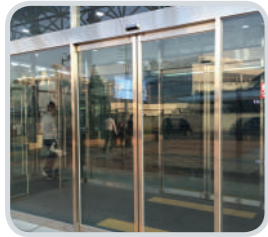
Sliding Automatic Door

A SAFE AND CONVENIENT WORLD, A WORLD WHERE TECHNOLOGY AND INNOVATION BECOME ONE.