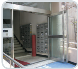
Panic Automatic Door