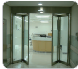
Folding Automatic Door