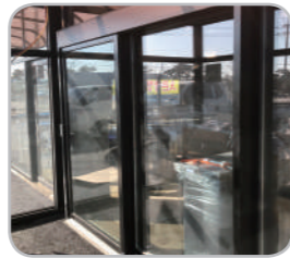
Insulation Automatic Door