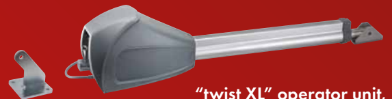
"twist XL" operator unit, 1-leaf (item no. 3280V000)