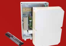
"twist XXL" control unit (item no. 3300V000)