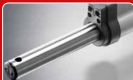
electronic limit switches with Reed contacts provide for a precise travel limitation