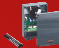
"twist XL" control unit (item no. 3282V000)