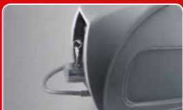
secure and convenient emergency release system